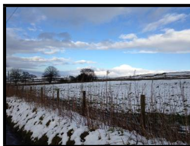
View towards the Cenotaph from Higham Lane March 2016