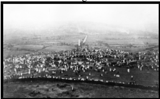
Unveiling of the Cenotaph 25 th June 1921