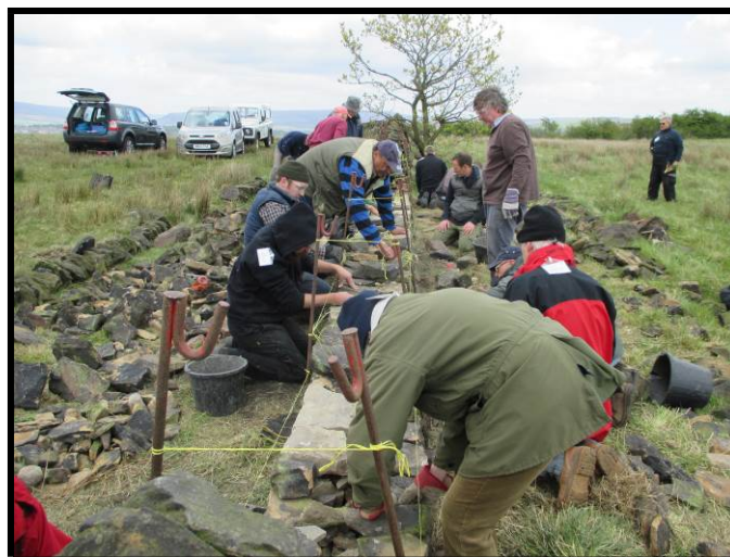
Dry Stone Walling Weekend at Hackingknife Meadow May 2015