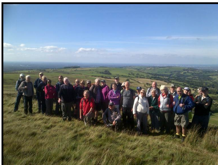
The 27 th Cown Edge Ramble September 2015