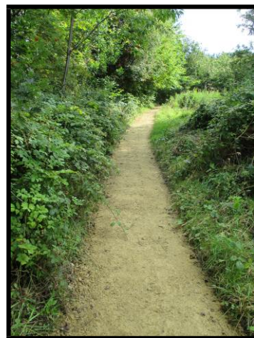
Baron Fields Footpath Improvements August 2015