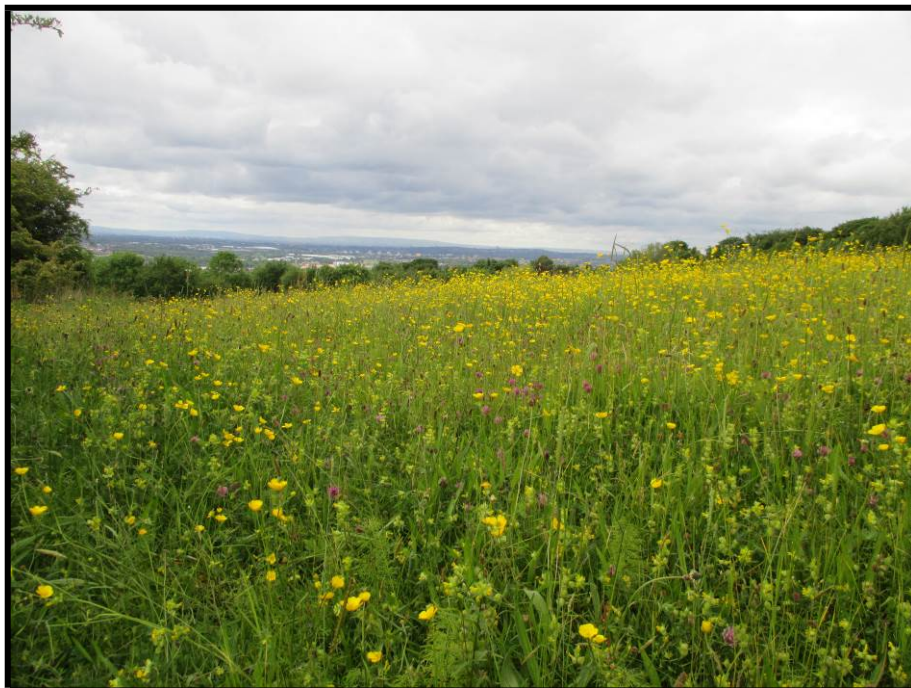
Higher Higham Meadows June 2015

The Country Park was officially established in 1980 when the Hyde War Memorial Trust and Tameside MBC and the Greater Manchester Council entered into a formal agreement relating to the management of the park. Responsibilities relating to the Greater Manchester County Council were passed on to Tameside MBC in 1986 when the County Council was abolished.