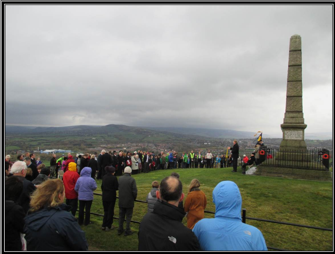
Remembrance Service at the Cenotaph 8 th November 2015.