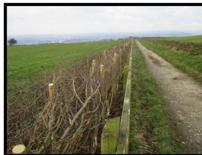
Rig Field Meadow 252 metres of Hedgelaying September 2015 to March 2016